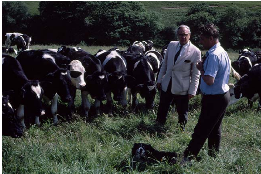
Dairy cattle grazing, Devon, UK